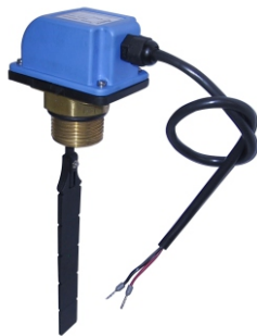
FSW - B-251