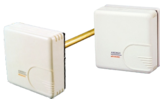
TEMPERATURE AND RH SENSORS